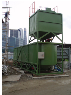
(Aqua-90 and bigger capacities)