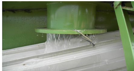
“Water out after treated”