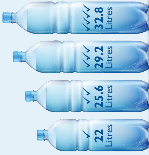
Amount of Water Saved in Litres

The illustration on the right indicates the amount of water you can save in 5 minutes when using a water efficient dishwasher as compared to washing dishes under a running tap.