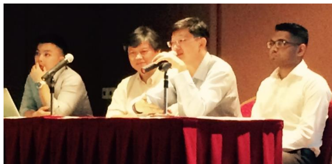
PUB representatives taking feedback/queries