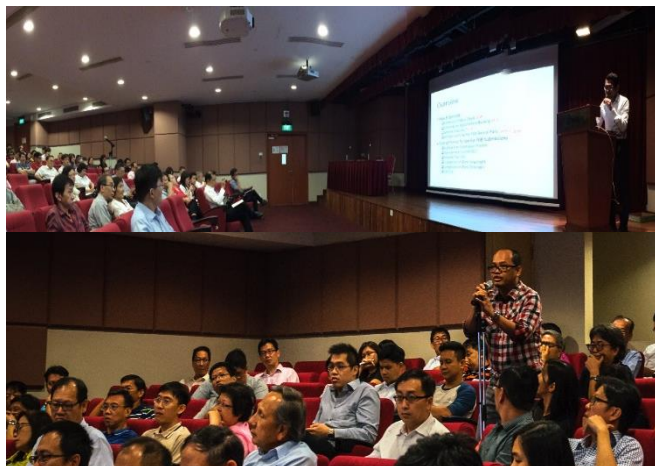
Participant giving feedback during one of the dialogue sessions

PUB shared on the technical requirements and cases studies. Following the briefings, there was a fruitful dialogue session where the participant took the opportunity to provide feedback and seek clarification from PUB.