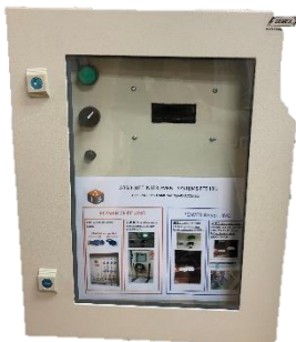
TOTAL SUSPENDED SOLIDS (TSS) CONTINUOUS MONITORING SYSTEM