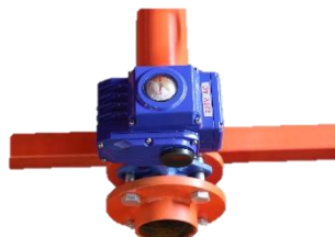
AUTO DESLUDGE VALVES